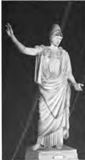
Fig. 12. Athena (known as "Minerva of Velletri").

When the great city of Athens was founded all the gods desired to have it as their own. Athena and Poseidon (Neptune) were recognized as having the best claim to it, and it was determined that of the two that one should be chosen who should give the best gift to the city.